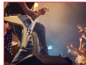
FESTIVALS & CONCERTS