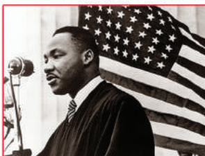
MARTIN LUTHER KING, JR. SITE