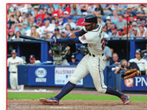
ATLANTA BRAVES BASEBALL

NONSTOP FLIGHTS TO MORE THAN 150 U.S. DESTINATIONS INCLUDING MIAMI, NEW YORK CITY, AND WASHINGTON, D.C.