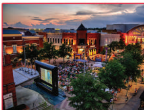
FANTASTIC SHOPPING CENTERS